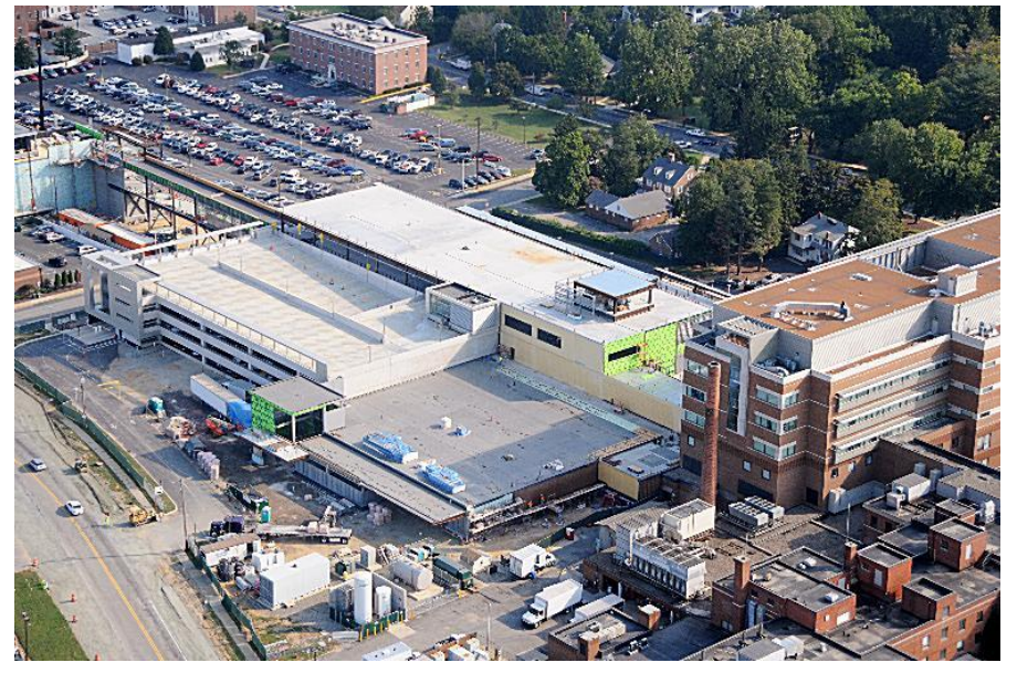
Figure 1

completed in May 2012. Whiting-Turner was chosen as